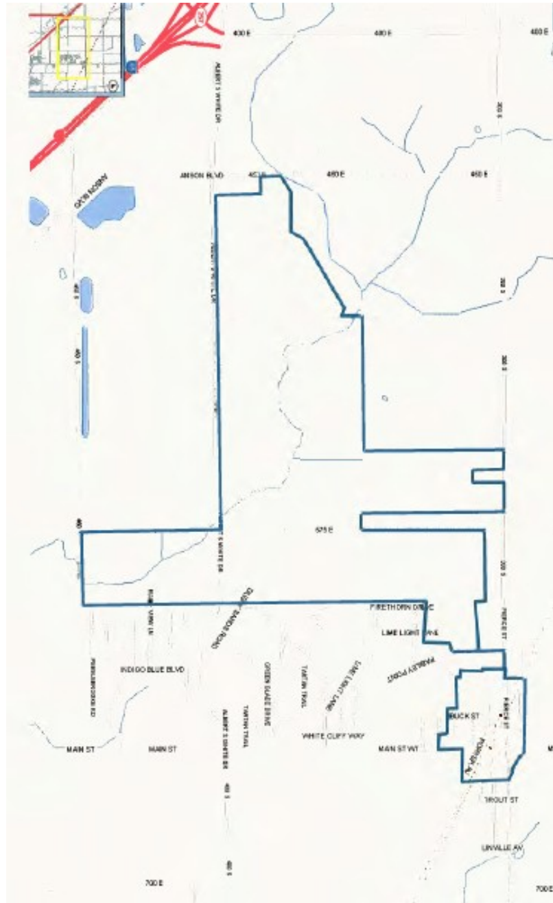
Map of Redevelopment Area and Allocation Area (inclusive of area within the blue border)