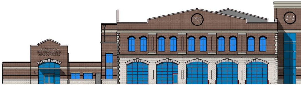
1 EAST ELEVATION - COLORED 1/16" = 1'-0"

Below are the proposed elevation drawings: