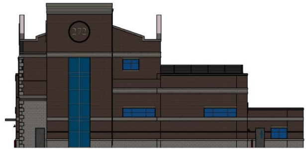
2 NORTH ELEVATION - COLORED 1/16" = 1'-0"