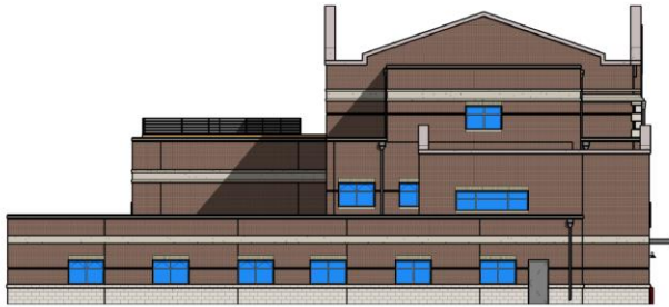
1 SOUTH ELEVATION - COLORED 1/16" = 1'-0"