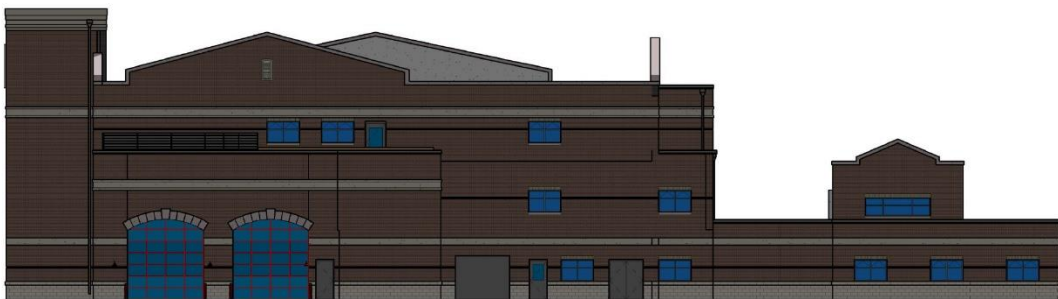
1 WEST ELEVATION - COLORED 1/16" = 1'-0"