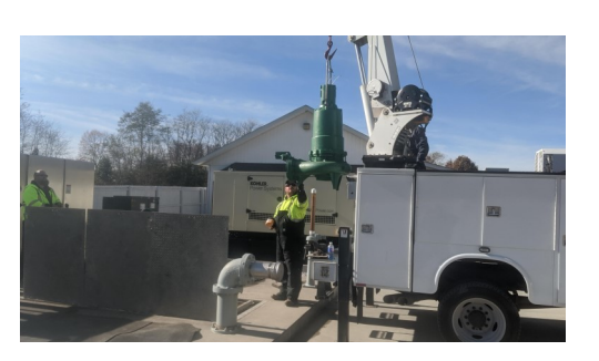
Royal Run Lift Station Pump Installation