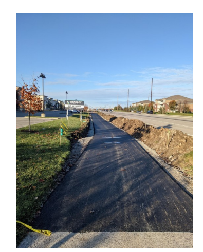
Maple Grove Walking