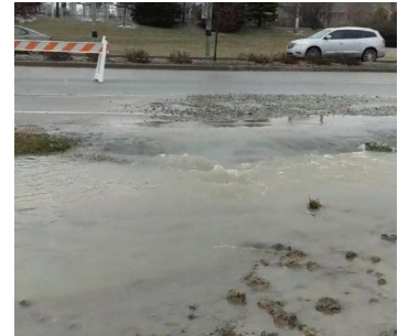
16" Watermain Break