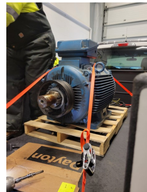
WWTP Blower Motor