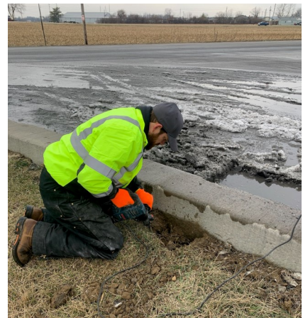
Installing Curb Drains near TA Truck Stop