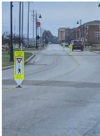
Schooler Dr. Pedestrian Crossing Signs