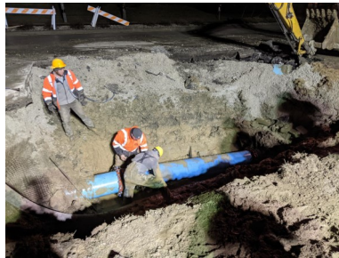
16" Watermain Repair