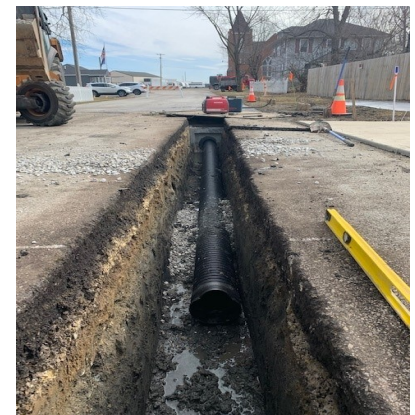
Turner Street drainage Improvements