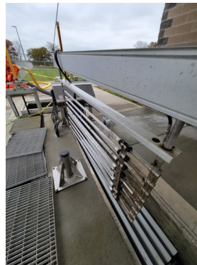
Maintenance of UV