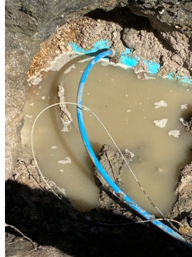
New service line replaced in Royal Run