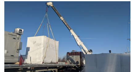
Indianapolis Road odor control unit being delivered