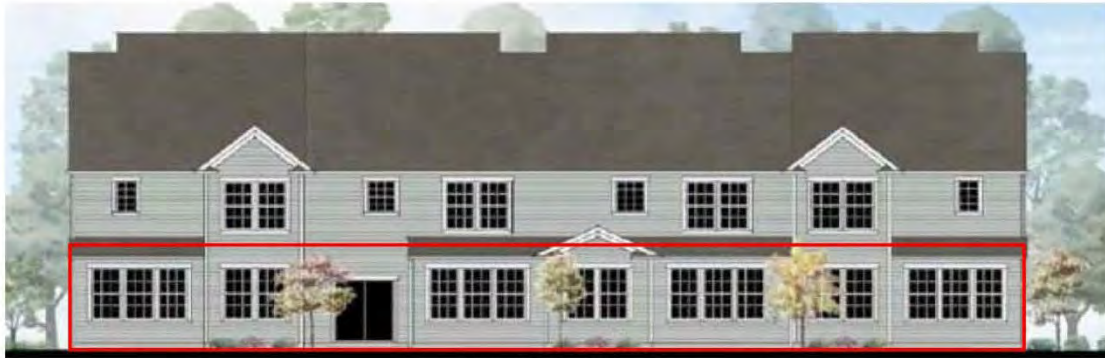
Typical Rear Elevation

* Area outlined in red intended area of masonry