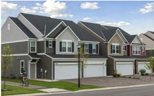
2-Story Townhome Architecture