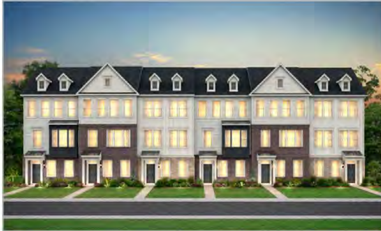
3-Story Townhome Architecture