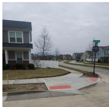
Curb Ramp Replaced in Clark Meadows