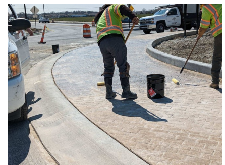
Main Street and Albert S White Roundabout