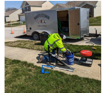
Repairing a Sunk Sidewalk Using the Sidewalk Jack.