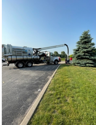
Repairing damaged Fire Hydrant