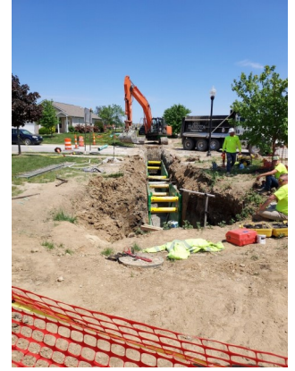
Crossing storm sewer at library on ASW