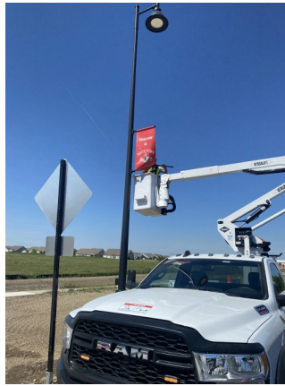
Hanging signs with new bucket truck