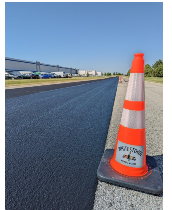
Liquid road on Performance Way