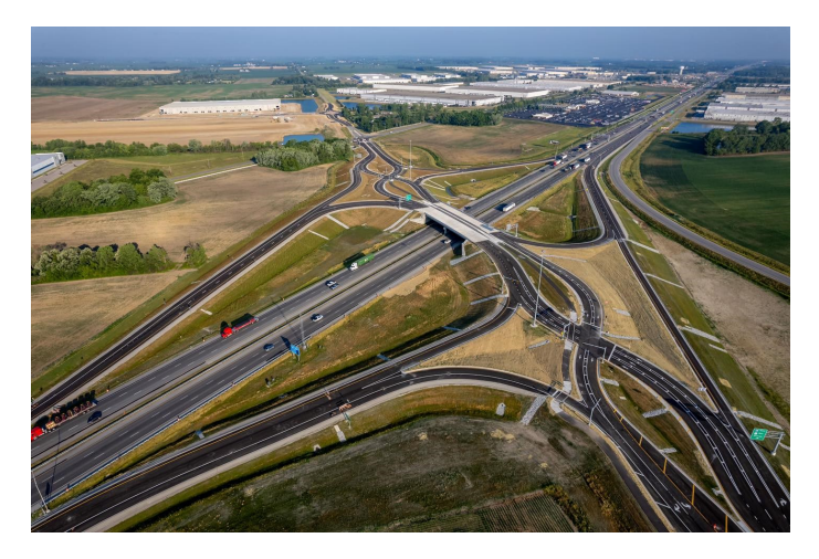
Midpoint Interchange over I-65 at exit 131