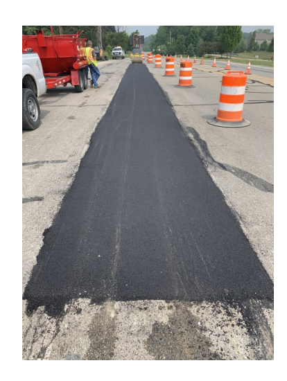
Making repairs on Whitestown Parkway