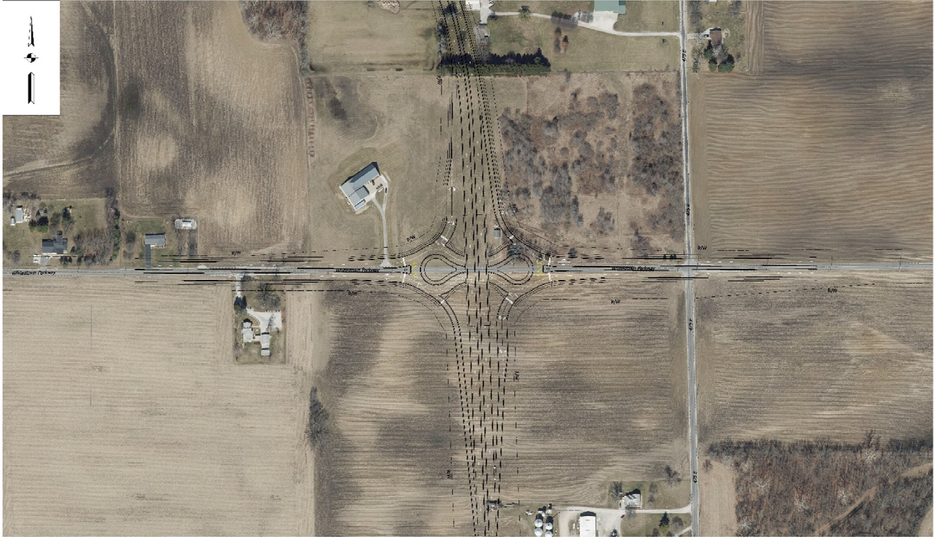
EXHIBIT M3: RONALD REAGAN PARKWAY & WHITESTOWN PARKWAY INTERSECTION TREATMENT – LONG TERM