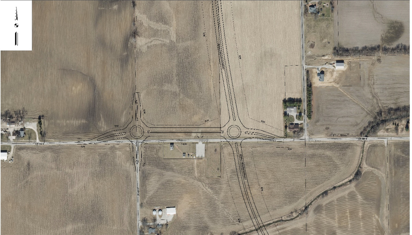
EXHIBIT M4: RONALD REAGAN PARKWAY & COUNTY ROAD 750 SOUTH INTERSECTION TREATMENT AND SHIFT IN ALIGNMENT