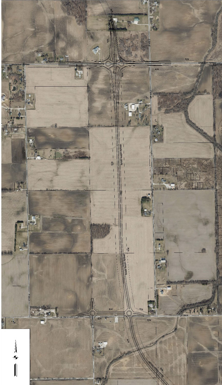
EXHIBIT M1: RONALD REAGAN PARKWAY INTERSECTION TREATMENTS