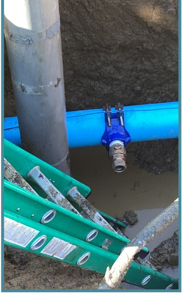
500 S PAVING PROJECT