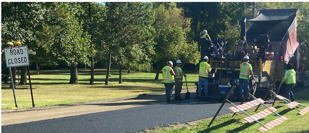
500 SOUTH PAVING PROJECT