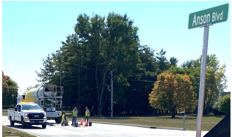
MANHOLE REPAIR ON ANSON BLVD