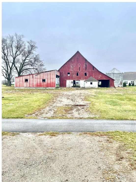
4285 S. Main Street