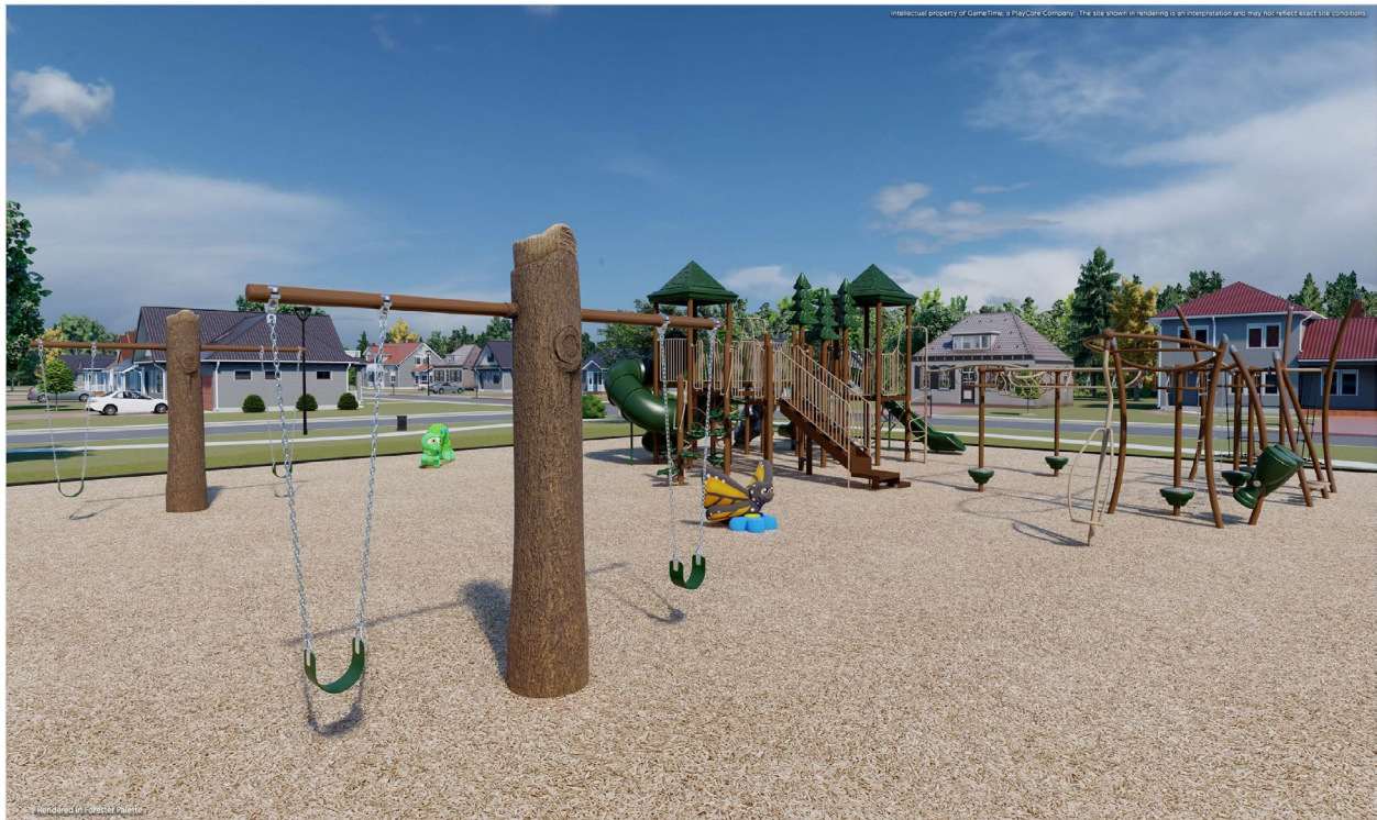
2816 Grassy Branch Drive (Rendering of Possibilities)