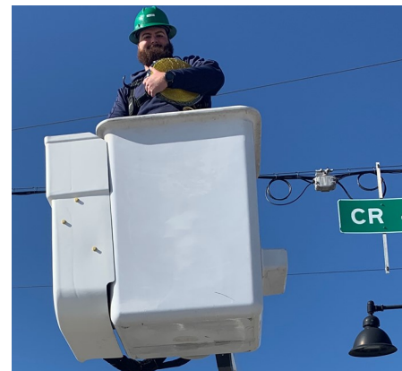
Street Dept. Changing Signal Bulb at Stop Light At CR 450