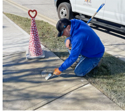
Water Dept. Lowering Watermain Valve Box in Harvest Park