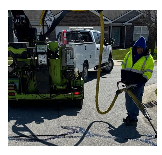
STREET DEPARTMENT CRACK SEALING IN WALKER FARMS