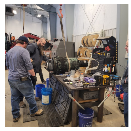
WASTEWATER REPAIRING A LIFT STATION PUMP