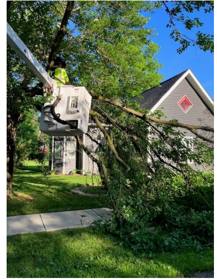
TREE REMOVAL ON TURNER ST FROM STORMS