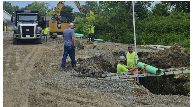
INSPECTIONS DEPARTMENT INSPECTING A SANITARY LATERAL