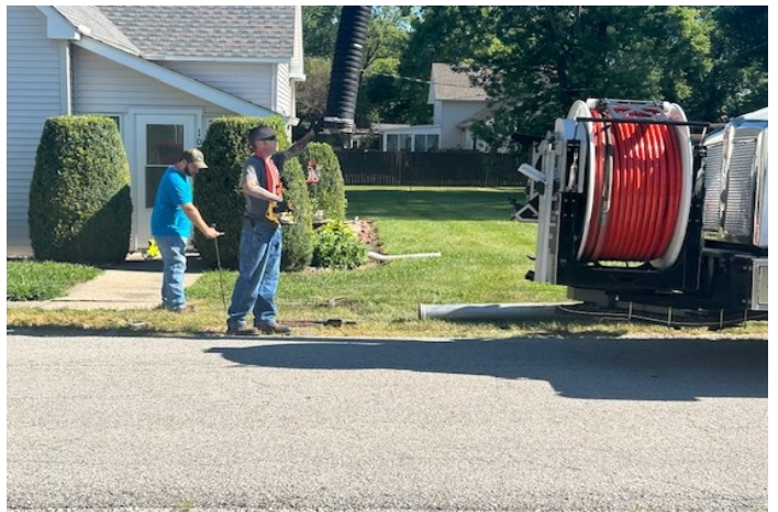
FIELD WORK FOR LEAD SERVICE LINE INVENTORY