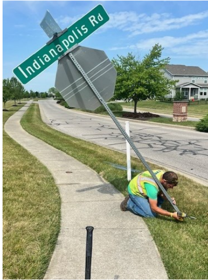
REPAIRING SIGNS IN EAGLES NEST