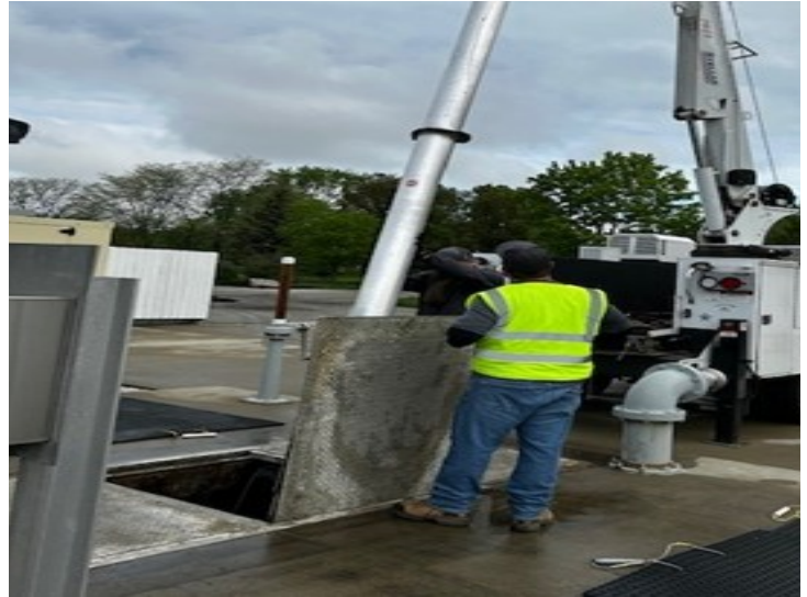
INSTALLING VAC TUBES AT ROYAL RUN LIFT STATION