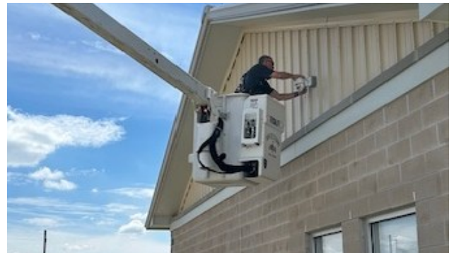
CAMERAS BEING INSTALLED AT NEW COMPLEX