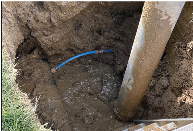
SERVICE REPAIR ON INDIGO BLUE BLVD